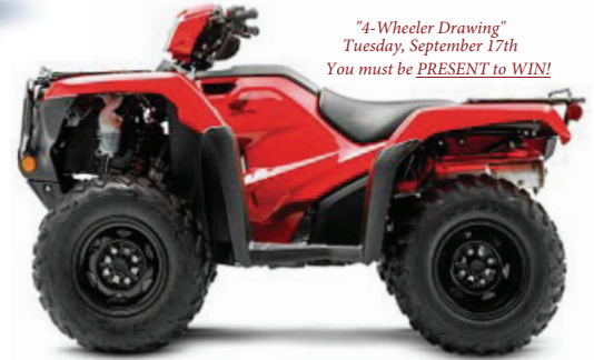
"4-Wheeler Drawing" Tuesday, September 17th You must be PRESENT to WIN!

Embassy Suites, Hotel Hot Springs, & Arlington Hotel Sunday, September 15th 5:30 pm - 10:30 pm Monday, September 16th 7:30 am - Midnight Tuesday, September 17th 7:30 am - 5:00 pm